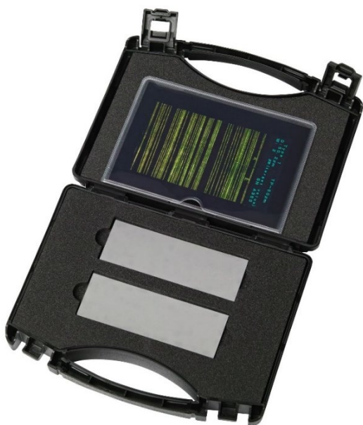
Twin Identical Panels with cracks